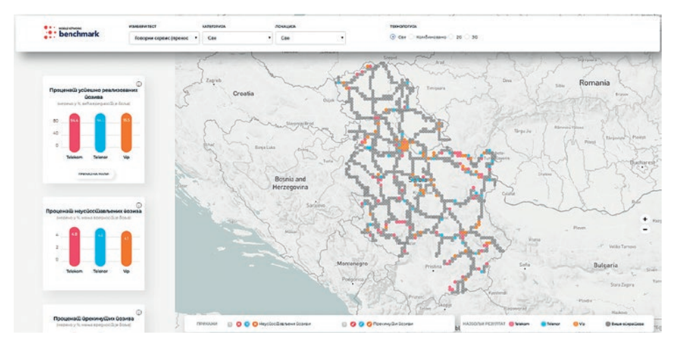
Layout of the Benchmarking interactive portal