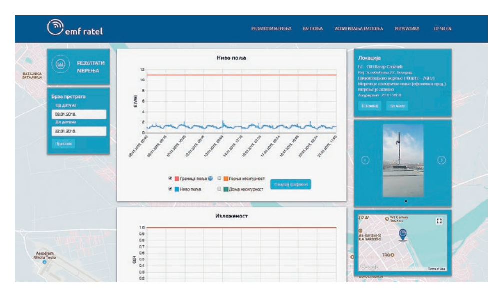
EM field level for a sensor located at elementary school "Lazar Savatic" in Belgrade

on site, while maintaining maximum system performance. Control and measurement equipment was configured so as to allow for RF spectrum monitoring t be performed in all weather conditions at selected locations.